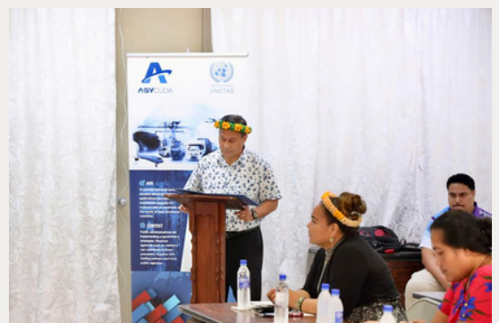
Caption: The Vice President of the Federated States of Micronesia, Mr. Aren B. Palik at the first launch ASYCUDAWorld system in Pohnpei.