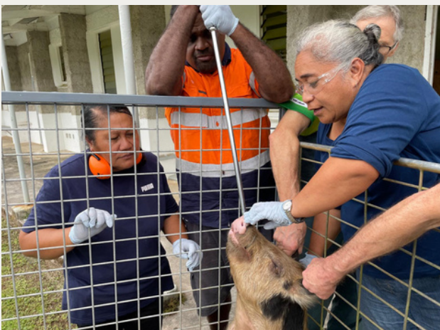
Caption: Paravet trainees being taken through the Summer School course organised by SAFE Pacific.

Six paravet trainees have passed their final assessment and are on their way to becoming fully certified paravets, marking a significant advancement in Niue's animal health capabilities and veterinary support services.