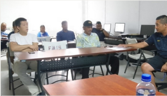
Caption: Participants from the Customs Division of the Finance Ministry at the Republic of Marshall Islands attend ASYCUDA training © UN Trade and Development ASYCUDA Pacific.