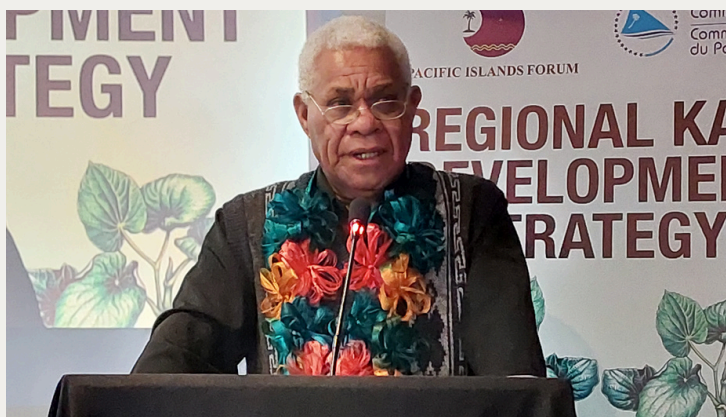
Caption: Vanuatu Minister for Trade and Commerce, Honourable Bob Loughman, at the Validation workshop for the Implementation Plan of the Regional Kava Development Strategy (RKDS)

Strategy (RKDS) on the 5th June the Vanuatu Minister for Trade and Commerce, Honourable Bob Loughman recognised that the event marked a pivotal moment.