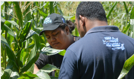
Caption: Samoa and Fiji participants practicing Fall Armyworm field scouting.